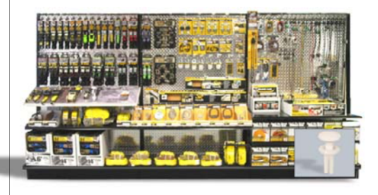
PegBoard X1<sup>™</sup> OverLay P/N: HPBO.X

Any questions or problems, please contact us: