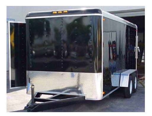
Trailer Stone Guard MX<sup>™</sup> P/N: HTSG

Any questions or problems, please contact us: