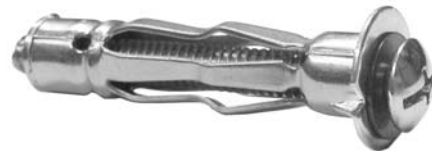
Expanding Hollow Wall Anchor for SlatWall P/N: HSL.WA

Any questions or problems, please contact us: