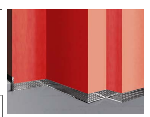
Base Molding MX<sup>™</sup> P/N: HBMA.LL

Any questions or problems, please contact us: