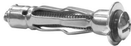
Expanding Hollow Wall Anchor P/N: HWA

Any questions or problems, please contact us: