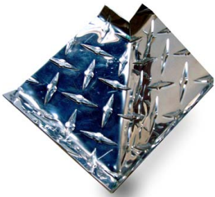
Crown Molding MX™ Inside Corner P/N: HCMIC