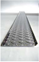
Crown Molding MX™