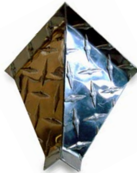
Crown Molding MX™ Outside Corner P/N: HCMOC