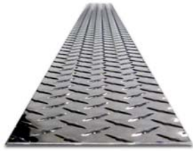
Chair Rail MX™